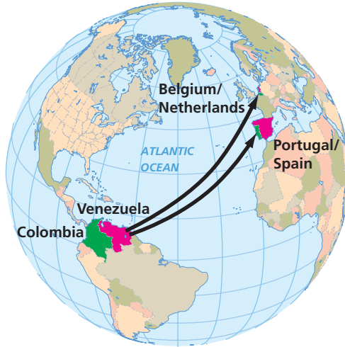
Figure 2.2 Colombian Cocaine-Trafficking Routes Direct to Europe