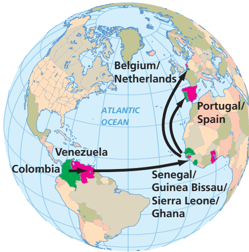
Figure 2.3 Colombian Cocaine Routes to Europe via West Africa