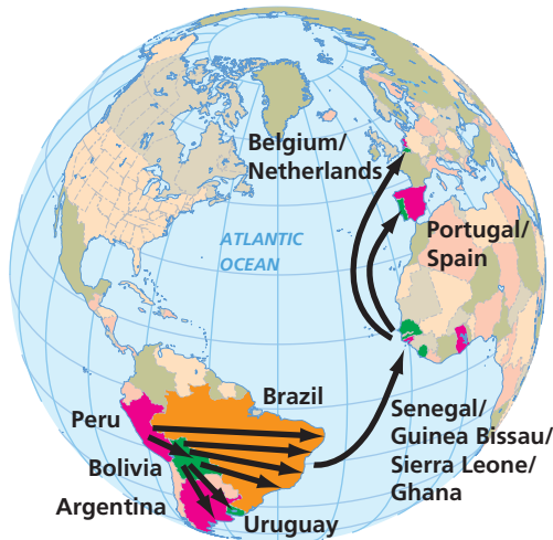
Figure 2.5 Peruvian and Bolivian Cocaine Routes to Europe via West Africa