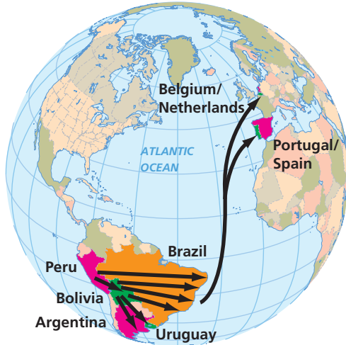
Figure 2.4 Peruvian and Bolivian Cocaine Routes to Europe